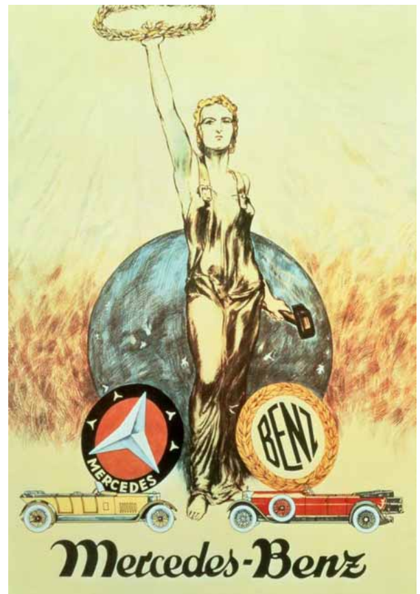
Vintage Mercedes Benz ad, circa 1926. Showing both auto companies logo's; signifying Diamler's 1901 Mercedes and Karl Benz's 1886 Benz Patent Motorwagon. The merger was complete!